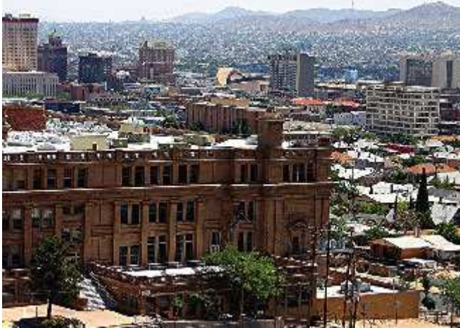
El Paso, TX

In 2007, the Creative Class Group, in partnership with The Knight Foundation, worked in five communities—Tacoma, WA; El Paso, TX; Tallahassee, FL; Duluth, MN; and Charlotte, NC—some of which have experienced dramatic losses of workers in their twenties and early thirties. In each city, organizers conducted two-day seminars with more than 30 community catalysts to create initiatives aimed at building sustainable regional prosperity in their communities. The seminars and initiatives were based around the three T's, along with a fourth T, for territory assets, namely the built and natural qualities that make a community unique.