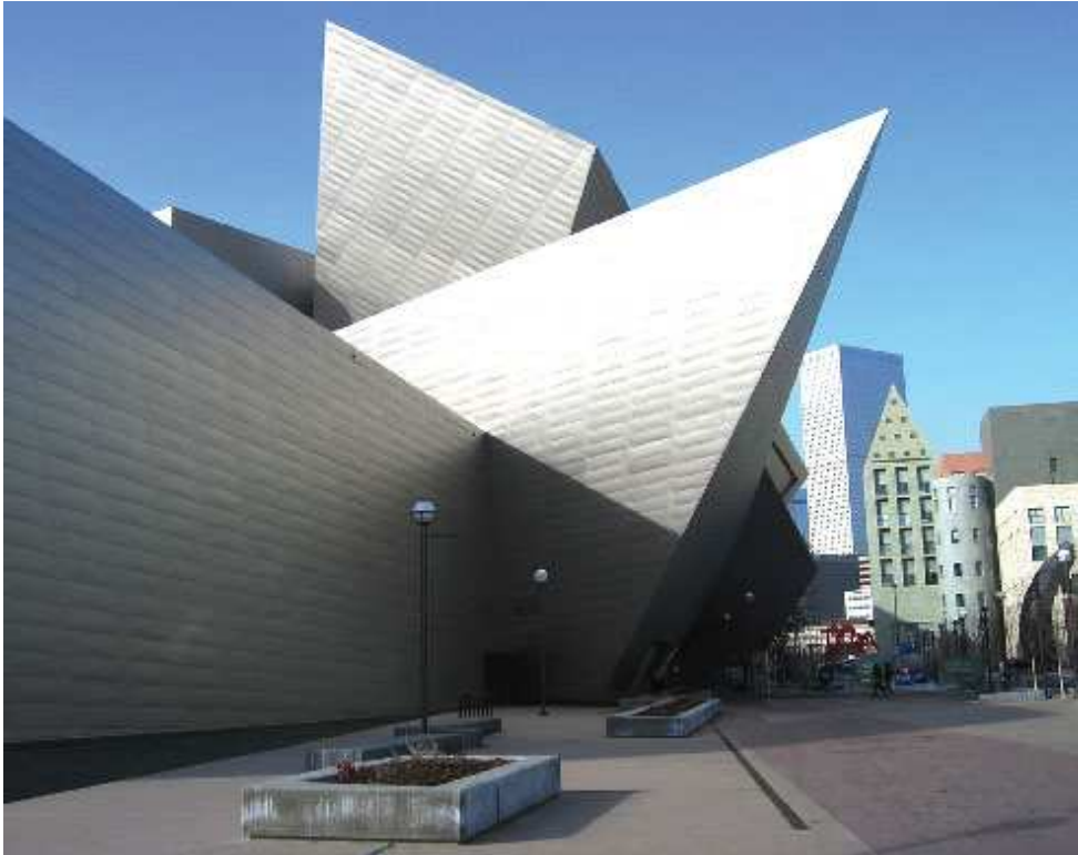
Denver Art Museum

Denver, CO has allocated a good deal of resources in recent years studying and improving its creative community with programs designed to simultaneously boost economic development and the commercial arts sector. The city uses a loan fund for creative enterprises and its administration uses various tools to grow the creative sector, realizing the role it plays in the overall economy and in attracting a high-quality workforce.